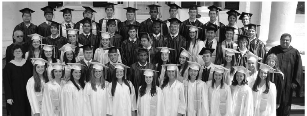
Saint John's Catholic Prep Class of 2011